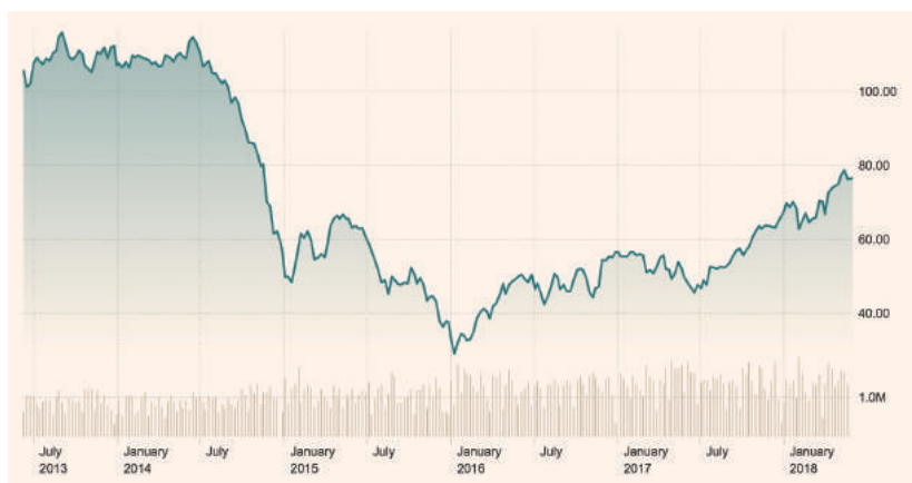
Figure 1: Brent Crude July 2013–May 2018